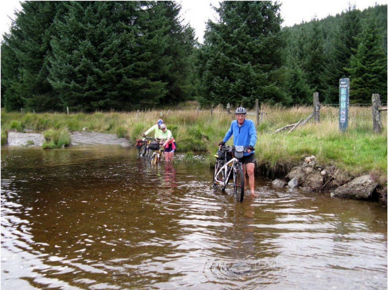
Recent heavy rainfall has resulted in a big flood event in the Tywi Valley, mid-Wales. This picture was taken during a prolonged dry spell in September 2013.

There is a delightful bridleway, which we use from time to time, running from Hopswood to Ansty as shown on the accompanying map. Nigel Hickman tells me that British Rail (or their successors) are carrying out some maintenance in the vicinity and are using the southern section for access. This has resulted in the area under the railway bridge becoming a veritable mudbath. I can confirm this, as one day this week I saw a couple of cyclists on the verge of B4029 scraping mud off their shoes and bikes.